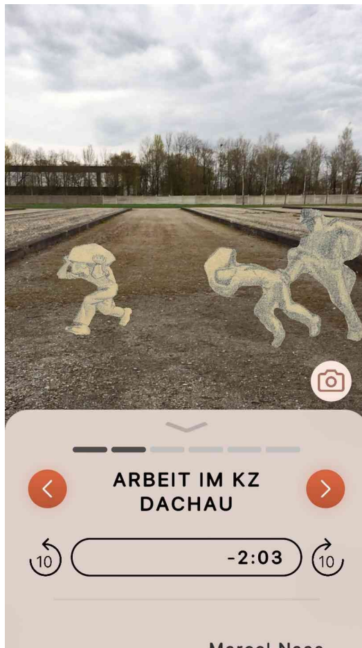
AR App ARt – Dachau Concentration Camp in Drawings and Paintings