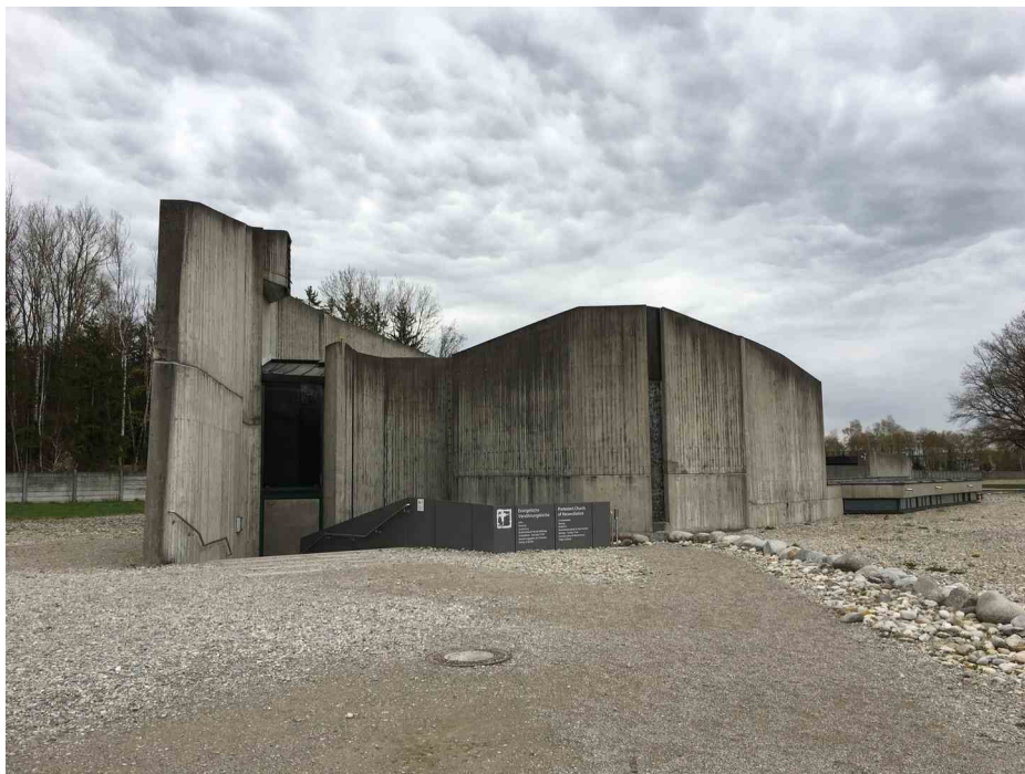
Dachau Concentration Camp Memorial, Protestant Church of Reconciliation