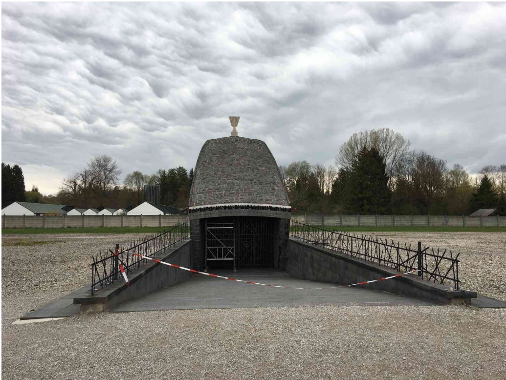
Jewish Memorial, under construction