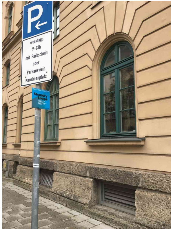
Sign for the Memory Loops Memorial in a street